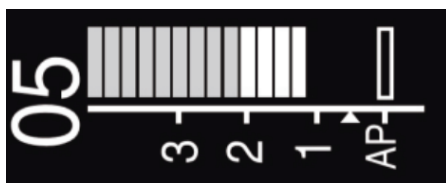
Apex Locator Bar