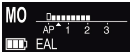
M0 - Stand Alone Apex Locator Mode